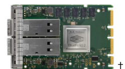
OCP 3.0 SFF †