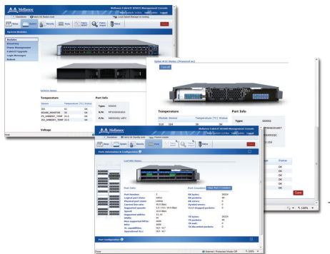
Figure 1. Sample Screenshots

The fabric management capabilities ensure the highest fabric performance while the chassis management ensures the longest switch up time. With MLNX-OS running on Mellanox's InfiniBand/VPI switches and gateways, IT managers will see a higher return on their compute as well as infrastructure investments through higher CPU productivity due to higher network throughput and availability.