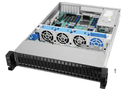
Figure 3: 2U Reference Platform