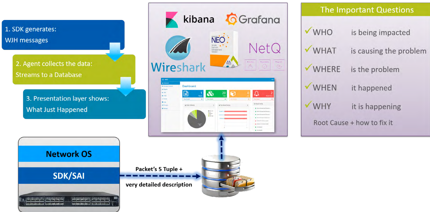
Figure 1. WJH - How does it work?